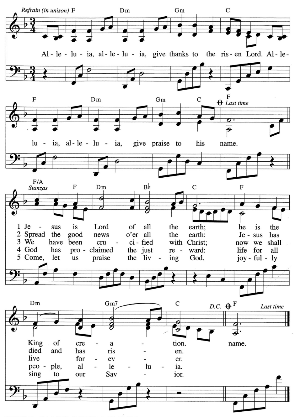
WORDS: Don Fishel, 1950-, © 1973 Word of God Publishers MUSIC: Don Fishel, 1950-, ©1973 Word of God Publishers; arr. Betty Pulkingham, 1950-, © 1973 Word of God Publishers